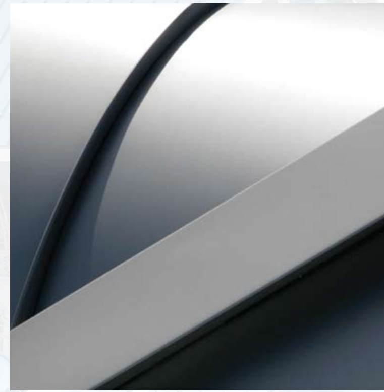
Curved Systems Mechanically Seamed