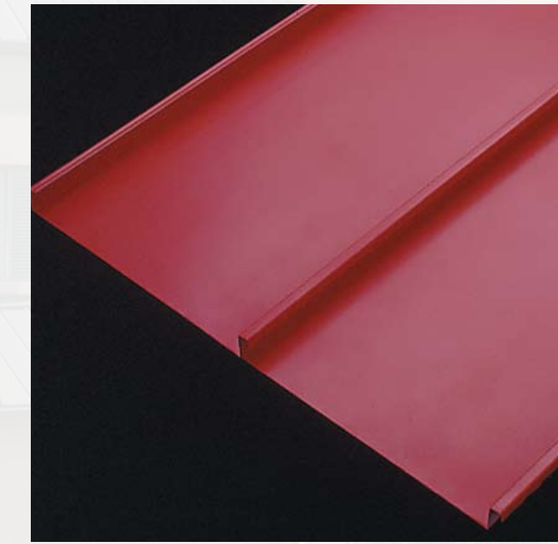
Integral Snap Lock Panel Mechanically Seamed

Contact Englert directly at 1-800-364-5378 for current LEED™ compliant information. Due to the limitations of printing processes, this color chart is not an accurate representation of our actual colors. Sample chips are available on request at no charge. All Englert colors are Energy Star compliant.